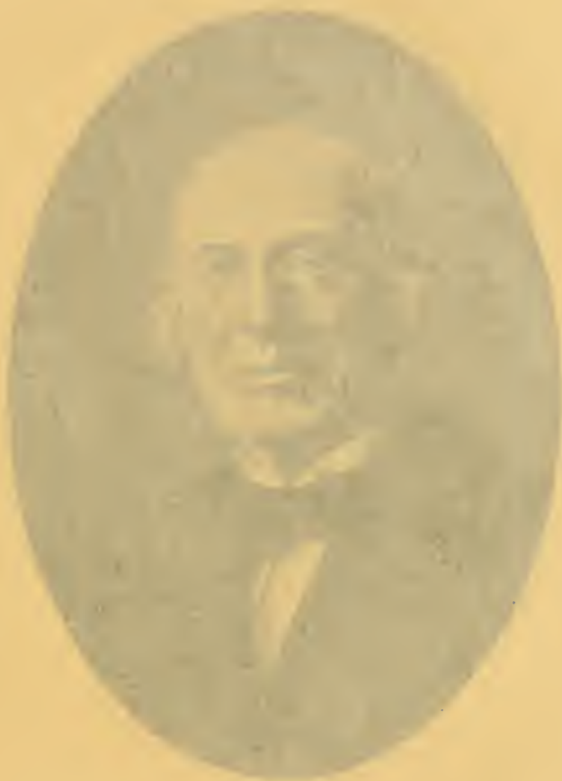
William Lloyd Garrison Boston, 1845