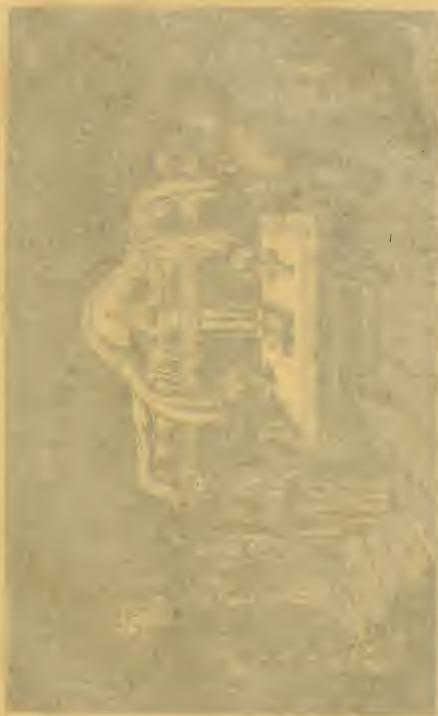
Russian Peasants at Mass The Peasants from the County of...